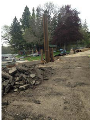
Sheet pile driving along south side of CTH J